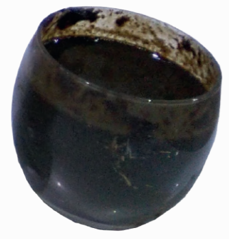
Rough liquid manure Digestate