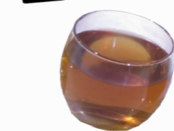
Liquid fertilizer N

V: 3 619t/an N: 0,33% P205: 0,05% K2O: 2,10%